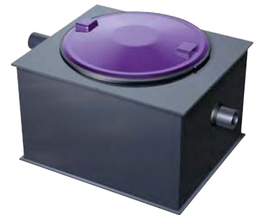
Illustration shows Art. no. 97 202/000